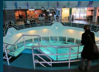
Touch Tank Session