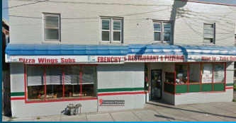
Frenchy's Pizzeria 2210 Niagara St, Niagara Falls, NY 716-282-5091