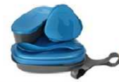
4A - Light My Fire Lunch Kit