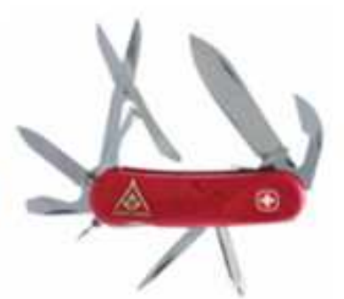
8B - Scouts Canada Knife