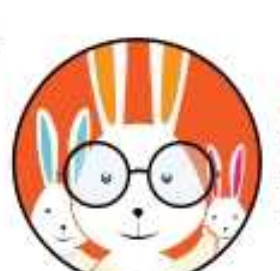
"OUICK LIKE A BUNNY" - You're on a roll! You sold one of each bag and tin