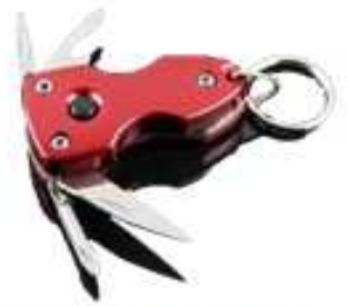
3B - SC 5 in 1 Tool (Scouts & older)