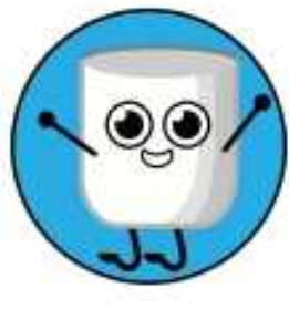
"YOU'RE ON FIRE!" - Great job! All your hard work has paid off! You're your Group's top seller! Because of you, your Group is one step closer to the great adventure and you've helped more kids like you join Scouting