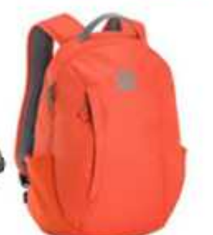
5A - MEC High Jinx Daypack