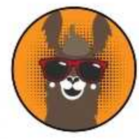
"COOL KID" - How will your Groups use this button? You can give away 1 a week and use it to recognize a youth however you'd like. Is it weekly top seller? Most improved? Best sales pitch? You decide!